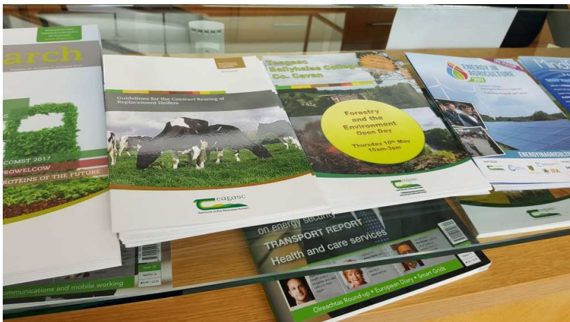
Picture 8. Promotional material of TEAGASC TTO